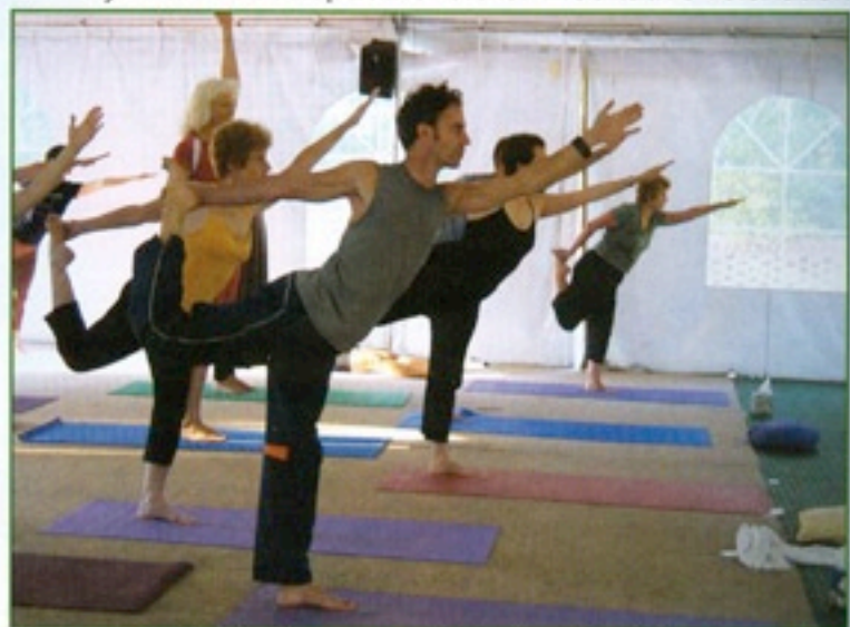
Students begin the journey within at an Amrit Yoga session.