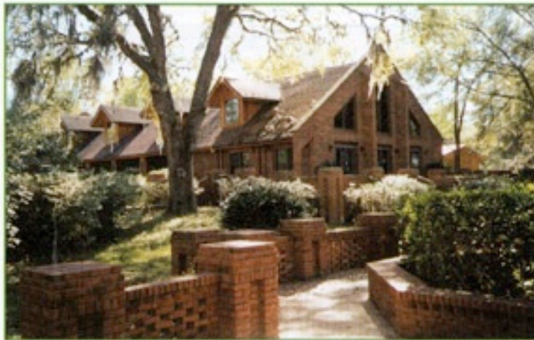
The picturesque Amrit Yoga Institute in Salt Springs, FL.

In the practice of Amrit Yoga postures, the focus is not on forcing the body to increase flexibility. Instead, your attention and awareness are focused on the point where your body is resisting and the mind is reacting. Ordinarily at this point, in a body-centered practice, most people unconsciously resist with a fight or flight reaction. At this point, you learn how to replace an unconscious